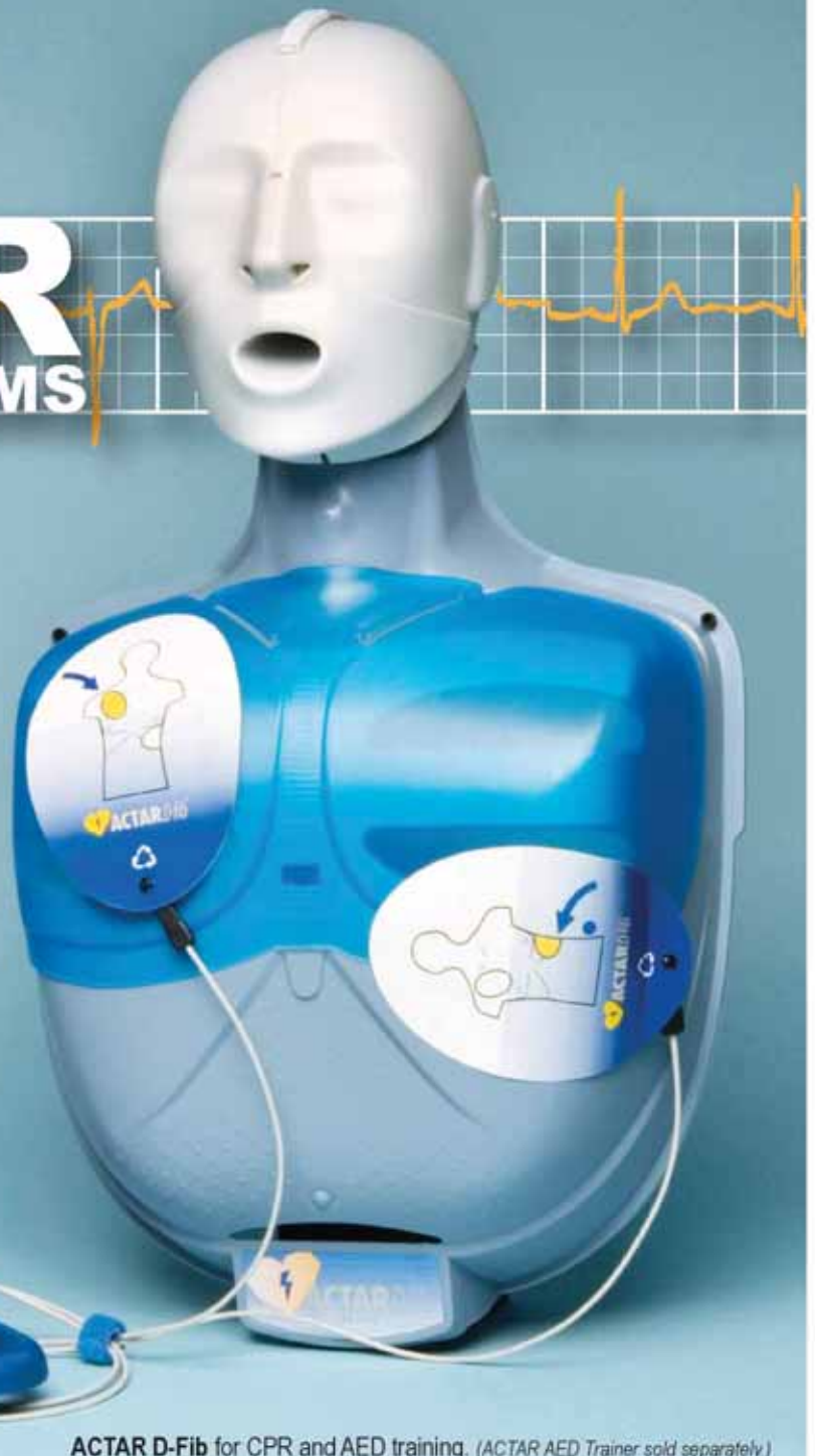
ACTAR D-Fib for CPR and AED training. (ACTAR AED Trainer sold separately.)

ACTAR products are lightweight and come in convenient carrying bags that are easy to transport. They are easy to clean and require little maintenance. A full line of accessories and parts is available as your systems age or when you need to restock supplies.