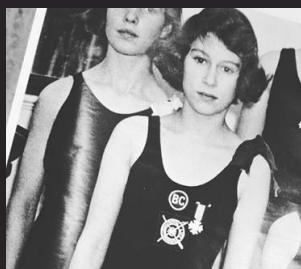
Her Majesty held several Society awards and was the first young person in the Commonwealth to achieve the Society's Junior Respiration Award.

The Royal Life Saving Society Canada extends its sincere condolences to the Royal Family on the death of Her Majesty Queen Elizabeth II. Her Majesty served as Patron of the Commonwealth Royal Life Saving Society over eight decades of extraordinary and selfless volunteer service. Lifesaving Society Canada members thank her for her unwavering interest in the success of the Society, her staunch support of its humanitarian work, and her generosity in hosting many 'Royal Lifers' at Buckingham Palace. Rest in peace.