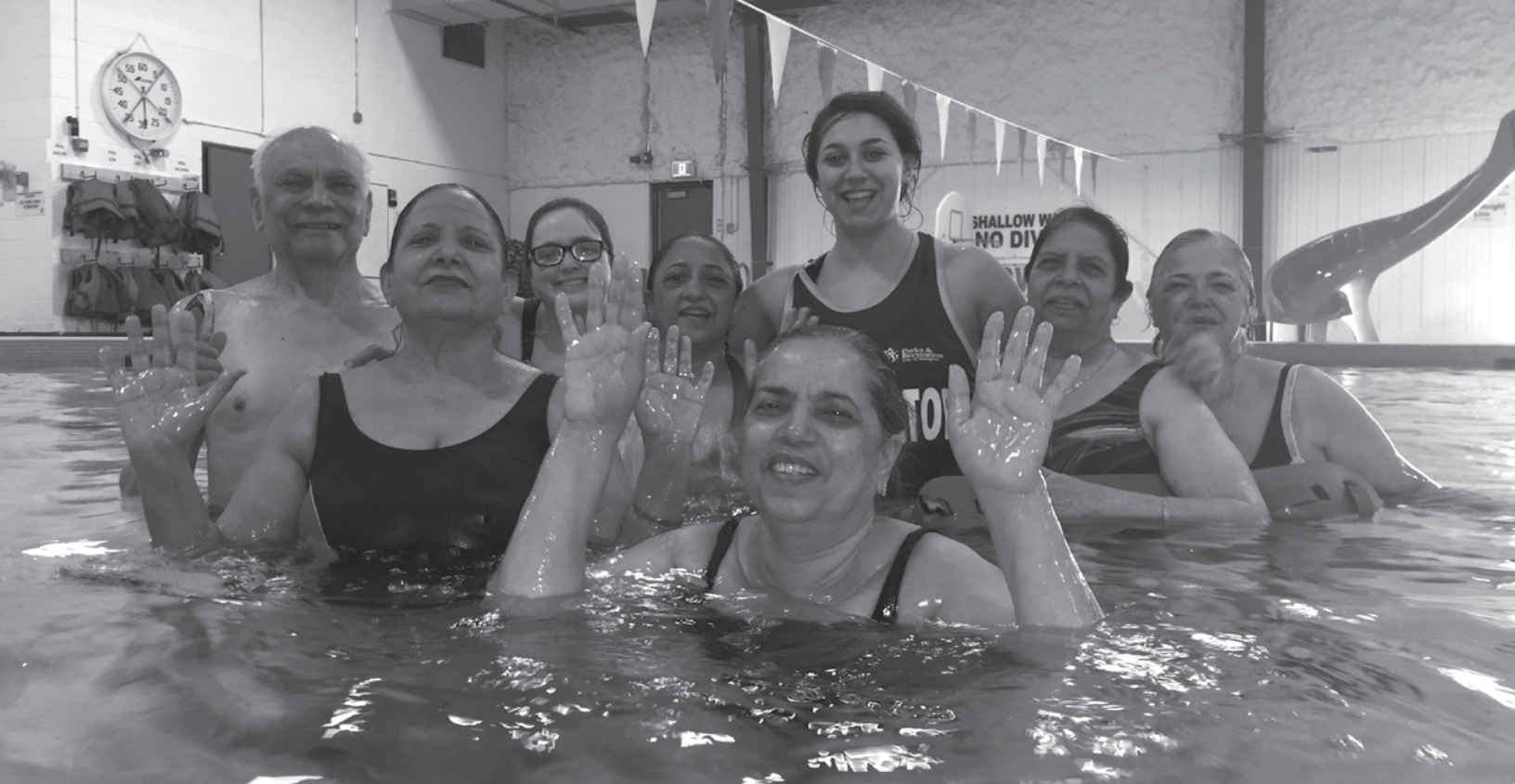
Swim to Survive participants in Brampton.