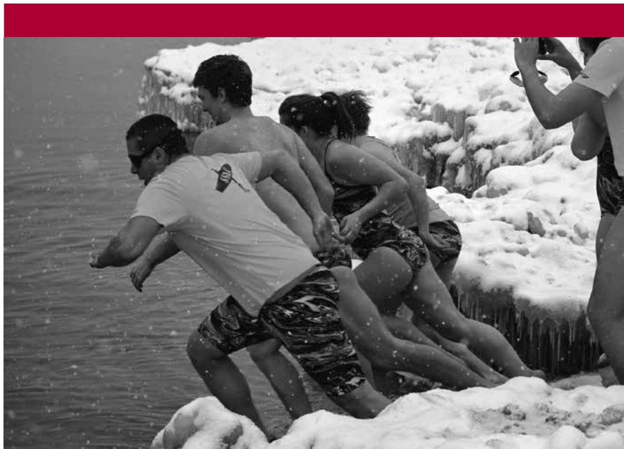
Participants of the 2015 Polar Bear Dip at Saugeen Shores.

We received additional support from: 4503431 Canada Inc. (Booth Family) , Pool & Hot Tub Council of Canada , Royal Canadian Legion – Dunsdon Branch #461 , Snappy Towels Inc. and the Waterloo Regional Aquatics Council .