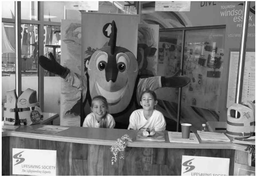
Drowning Prevention Day at Adventure Bay Family Water Park.

The fund honours the memory of this exceptional athlete and covers the lifeguard training costs of London-area recipients.