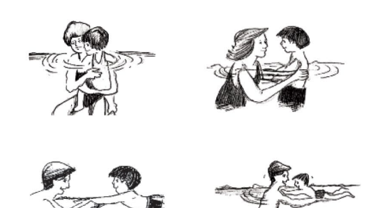
Back cradle position