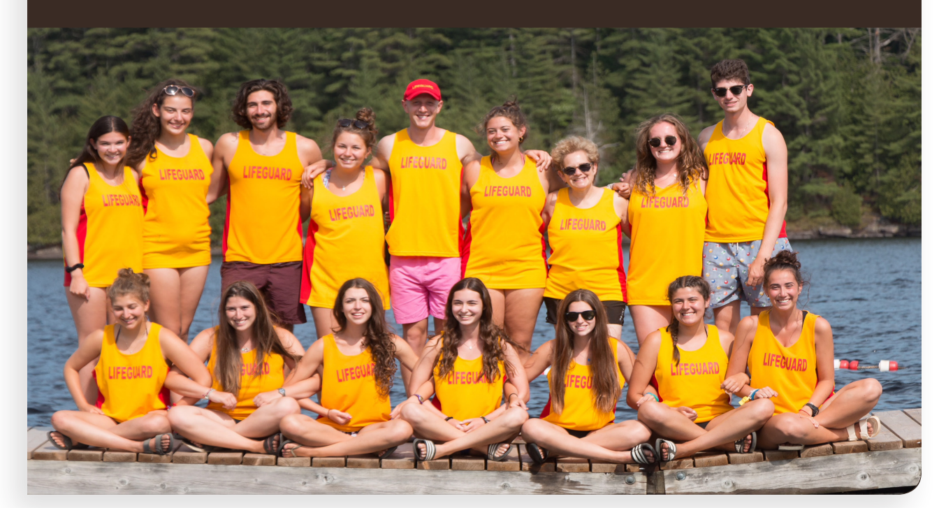
Camp Tamarack staff

Lifeguards across the province took part in the Lifesaving Society's 10th annual 500 Metre Swim for 500 Lives, held during National Drowning Prevention Week 2018. Thanks to Camp Tamarack and Zodiac Day Camp for participating and fundraising for drowning prevention.