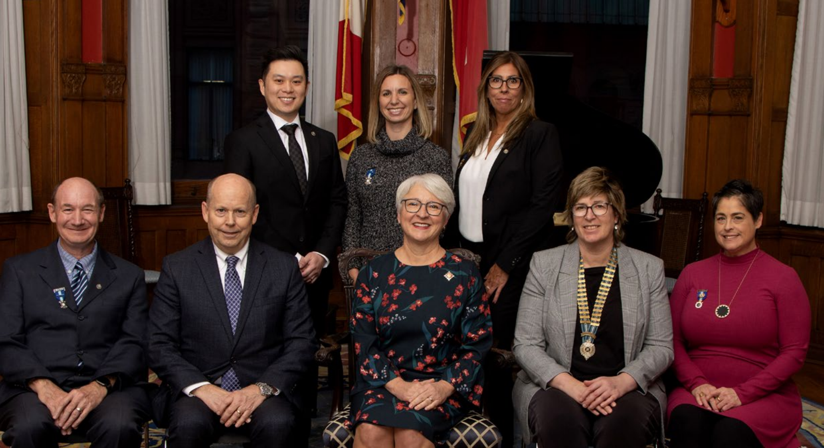
Queen's Park Investiture of Royal Life Saving Society Commonwealth Honour Awards